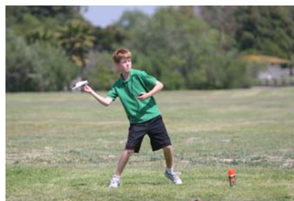
Simple can still be fun!