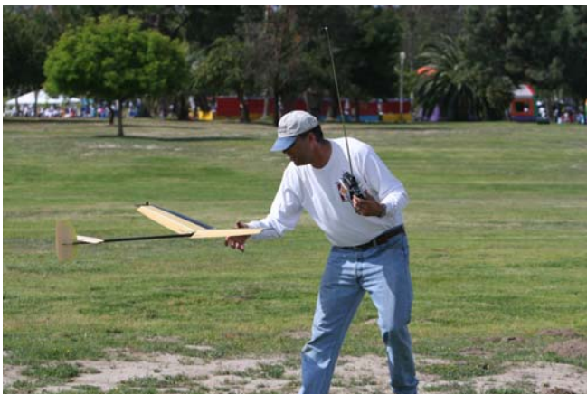
Another successful flight !