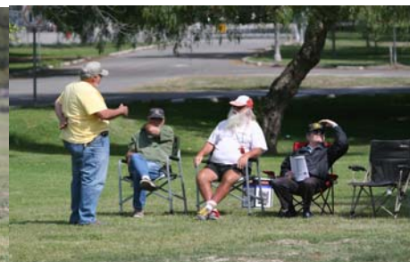
Just another beautiful day in the park!