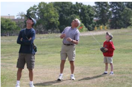
3 generations, what a great sight!

Some people really should just stick to the flight simulator. Maybe the guys who spend 2 thousand hours building a scale warbird need to get out and fly a little more. Either way, this video is a hoot .