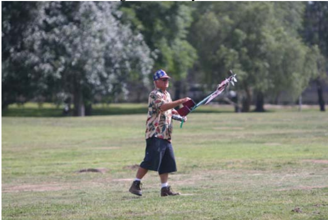
Hide the women and children!